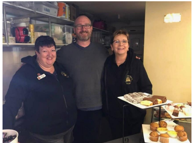
The Three Jacs at the Youthfest!

Thanks to our sponsors: Verge Studio, Kookaburra cinema, Docuprint and Paragon.